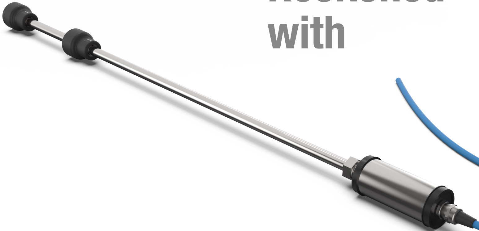
DFS DMP Magnetostrictive Probe (s)