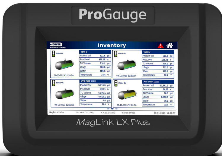
ProGauge MagLink LX Plus