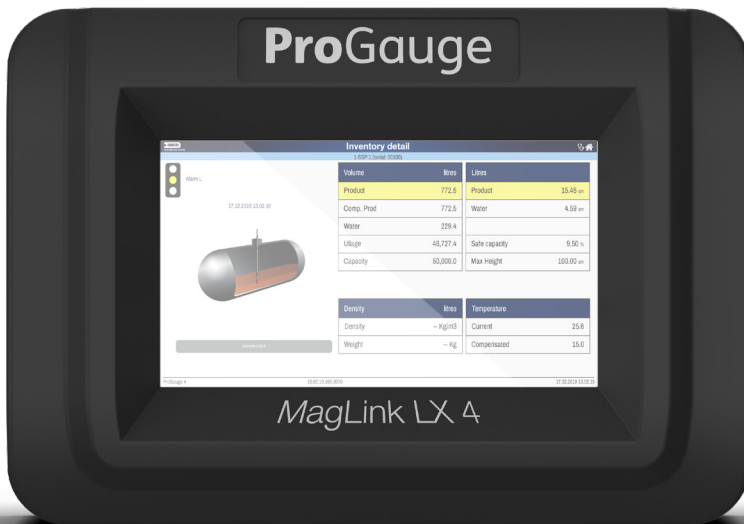
ProGauge MagLink LX 4 console