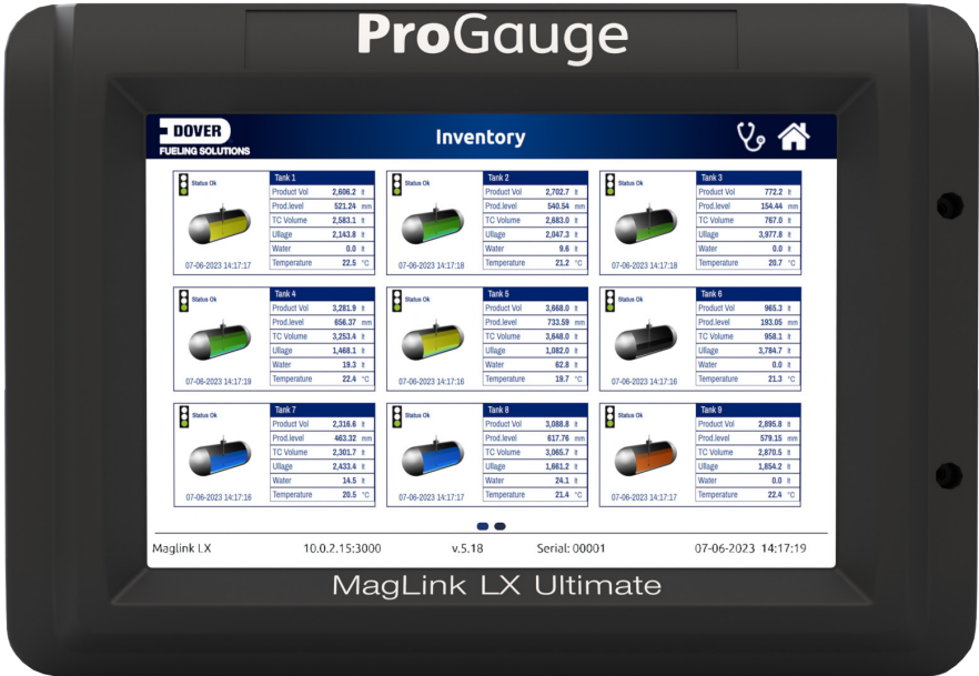
ProGauge MagLink LX Ultimate console