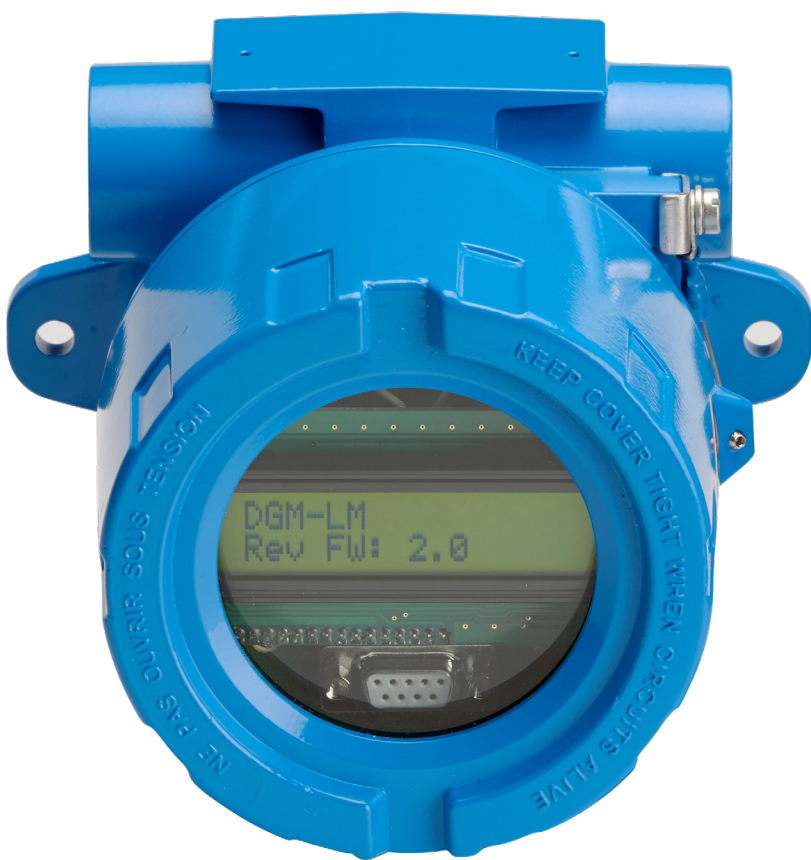
ProGauge Digimon LCD Atex console