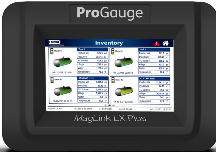
ProGauge MagLink LX Plus console

The ProGauge MagLink LX Plus console, comes with a brilliant 7" color display with intelligent "touch and swipe" technology. The MagLink LX Plus is a console designed to be scaled up. With base monitoring capabilities of up to 12 probes (coupled with patented multi-drop technology, which reduces installation costs), this console can be easily enhanced to add Continuous Statistical Leak Detection (CSLD), Electronic Pressurized Line Leak Detection (PLLD), relays or input connections, and up to 48 sensors.