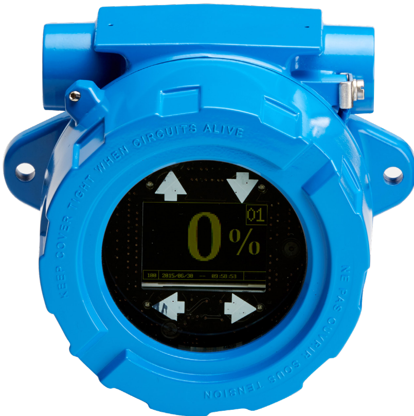
ProGauge DigiMon 16T console

Power supply 9-30 Vdc and internal battery with measure on request through a magnet when power to console is lost